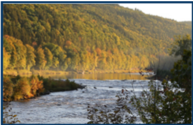
The Delaware River in Autumn, photo by David Soete.

Yes, we would like to do more: maybe a What's in the Water focused on California! - a major oil and gas producing state with "green" intentions and water shortages. With your help it can happen.