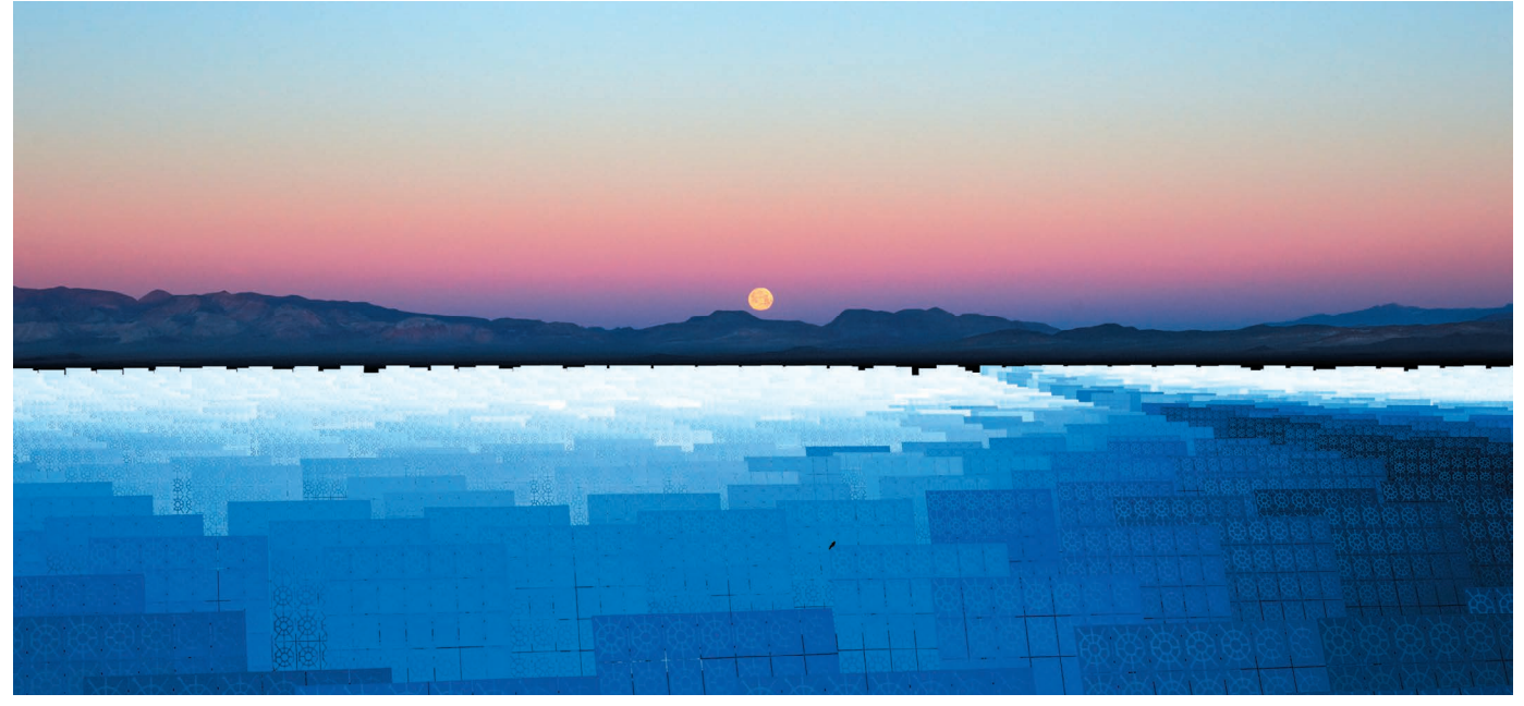
Decarbonizing the world economy will require renewable energy generation from vast solar farms, such as this one in Nevada.