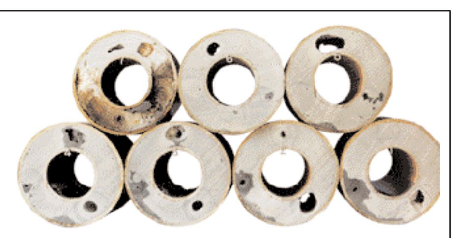
Figure 3: Test cores of cement subjected to gas flow of 6 liter/min before the slurry achieved adequate gel strength. Controling gas flow depends on the severity of the problem. For small gas-flow potentials, fluid-loss control may be sufficient. For moderate GFPs, exceptional fluid-loss control techniques are called for. In severe cases, especially high-temperature wells, fluid-loss control additives, job modifications and de-layed gelling agents alone are not enough. Highly compressible cements are needed in these situations.

When gas is flowing through drilling fluid channels and filter cake, the flow volume can usually be expected to increase as the