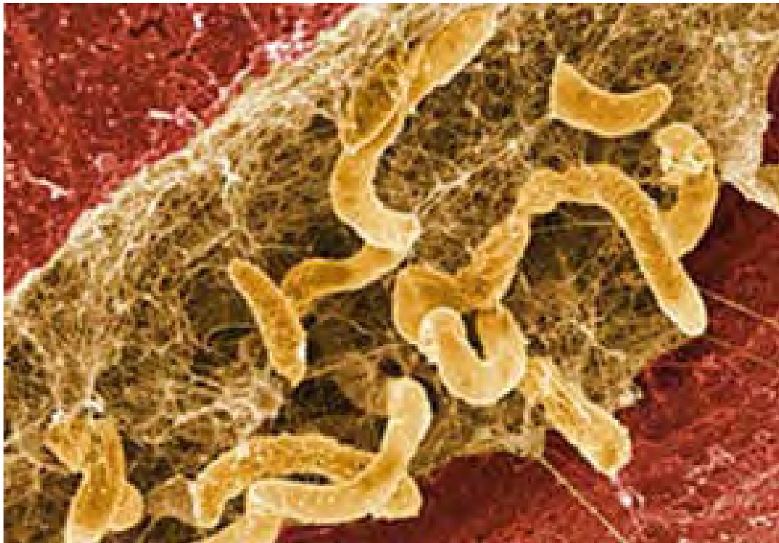
Figure 2: Biofilm of Desulfovibrio desulfuricans Growing on a Hematite Surface